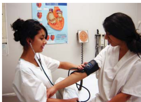
Extern preps an exam room; Medical Assisting students practice taking blood pressure.