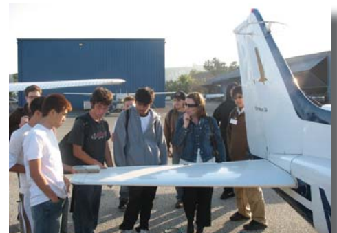
Aerospace Engineering students tour Torrance Airport.