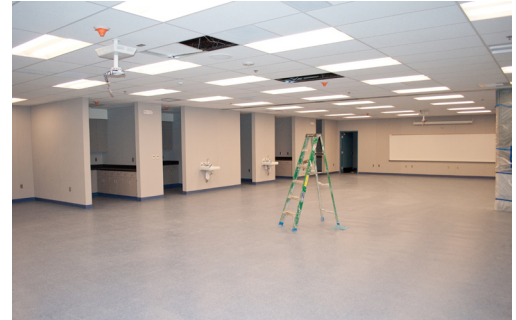
Top (l-r): New registration area; new dental classroom. Bottom (l-r): New Registration area; new Medical Assisting classroom.