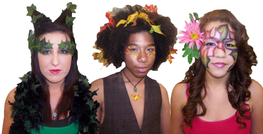
Examples of theatrical halloween make-up recently created by students: left to right: poison ivy theme; fall theme; and a fairy