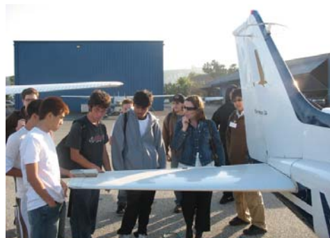
Aerospace Engineering students tour Torrance Airport.