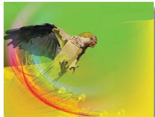
Artwork created in Adobe Photoshop.